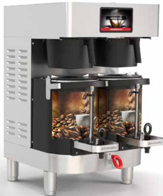
Model PBC-2W air-heated Shuttles and graphics sold separately