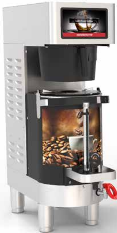
Model PBC-1W air-heated Shuttles and graphics sold separately